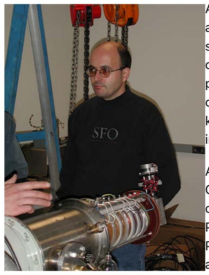
Large equipment is a fixture in Schamiloglu's lab

Around this time, Schamiloglu read an article in Popular Science about fusion science and was captivated. The oil crisis of the 1970s was raging, and many people were starting to seriously consider alternate energy sources. He knew then he wanted to pursue studies in fusion plasma physics.